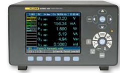
Fluke Norma 4000