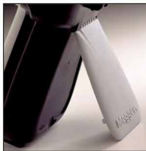
Rugged rubber boot with built-in stand