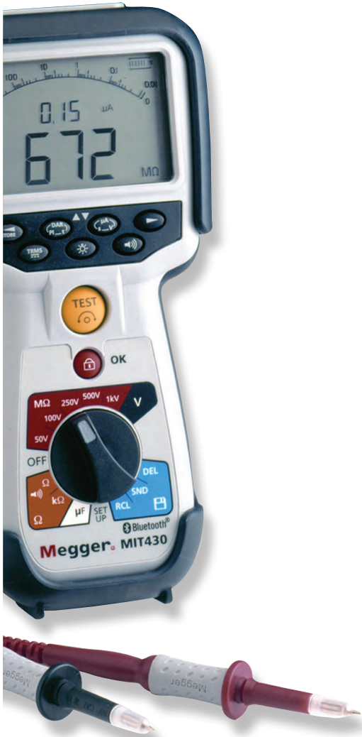
The MIT430 offers result storage, recall and Bluetooth downloading

The MIT410-TC and MIT430-TC allow the user to determine the condition of the insulation of twisted copper cable pairs, which could cause problems for services such as voice, video, and data or VOIP. When the insulation becomes weak or brittle, causing cracks or exposing copper within the cable, or water ingresses into the cable, the insulation resistance test will identify these situations immediately.