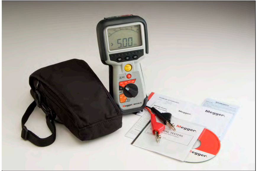
The MIT410-TC shown with its soft canvas carrying bag and bed of nails lead set