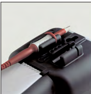
Convenient probe storage on back of instrument