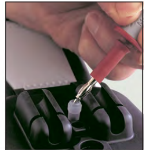
Safe storage for probe caps