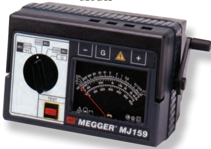
General Purpose Model