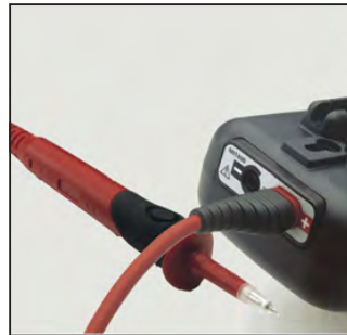
SP5 remote switch probes included with most units