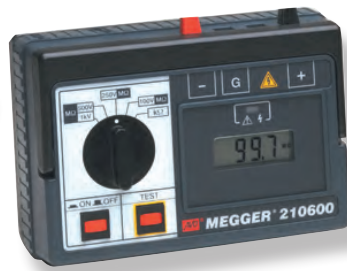
Digital Autoranging Model