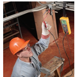
Magnetic Meter Hanger frees up both hands to focus on making measurements safely.

Check connections and motor windings with Lo ohms/earth-bond continuity test.